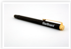
Stylus pen (included)